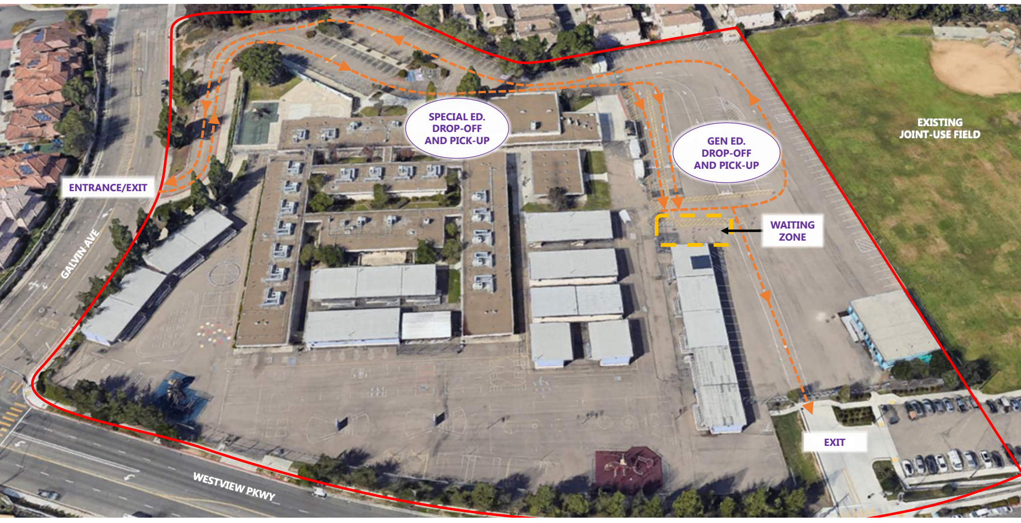
Review existing drop-off/pick-up